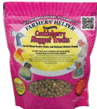
338 • 27 oz. • 6/cs. Farmers' Helper™ Cackleberry Nugget Treats™