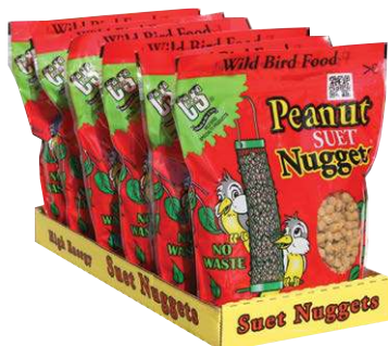
NUGGETS™ CASE OF 6