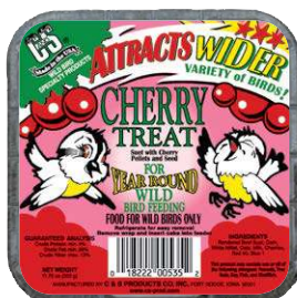
535 • 11 3 / 4 oz. • 12/cs. Cherry Treat