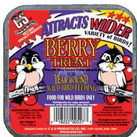
527 • 11 3 / 4 oz. • 12/cs. Berry Treat