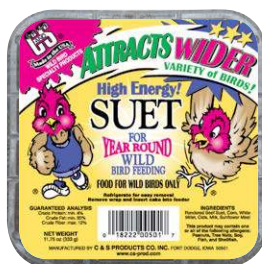
501 • 11 3 / 4 oz. • 12/cs. High Energy Suet