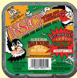
531 • 11 3 / 4 oz. • 12/cs. Insect Treat