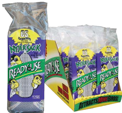
951 • 12 oz. • 8/cs. Nyjer® Sack