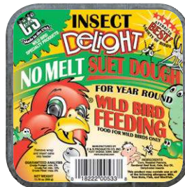
533 • 11 3 / 4 oz. • 12/cs. Insect Delight