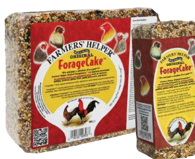
303 • 2.5 lbs. • 6/cs. Farmers' Helper™ Original ForageCake™