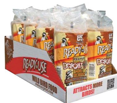
READY-TO-USE CASE OF 8