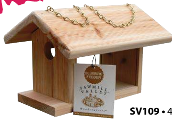
SV109 • 4/cs. Bluebird Feeder 11 7 / 8 " x 9" x 8" high