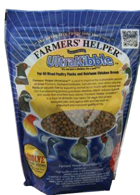
331 • 28 oz. • 6/cs. Farmers' Helper™ UltraKibble™