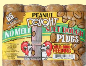
680 • 12 oz. • 4 pack • 12/cs. Peanut Delight No Melt Plug