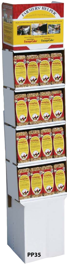
11 3 / 8 " d x 12 1 / 4 " w x 58 1 / 8 " h