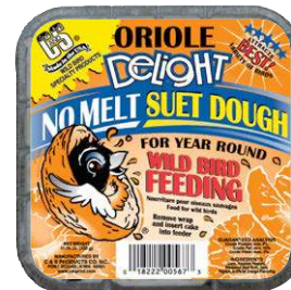
567 • 11 3 / 4 oz. • 12/cs. Oriole Delight