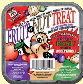
549 • 11 3 / 4 oz. • 12/cs. Fruit n' Nut Treat