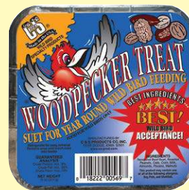
569 • 11 oz. • 12/cs. Woodpecker Treat