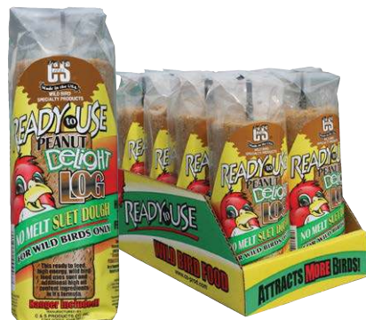
907 • 16 oz. • 8/cs. Peanut Delight Log

C&S HAS CREATED READY TO USE PRODUCTS for the beginner or experienced consumer. Easy to use and hang for instant feeding. The Logs are based on popular No Melt Delight formulas and Nyjer® for Finches and other small birds. These items will make great gift ideas.