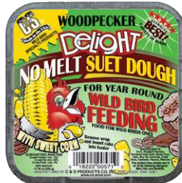
571 • 11 3 / 4 oz. • 12/cs. Woodpecker Delight