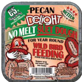
555 • 11 3 / 4 oz. • 12/cs. Pecan Delight