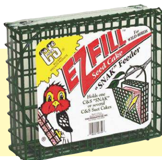
749 • 6/cs. EZ Fill Seed Cake Snak™ Feeder 2 3 / 4 " x 8 3 / 8 " x 7" high Holds 1 ForageCake (2.5 lbs.)