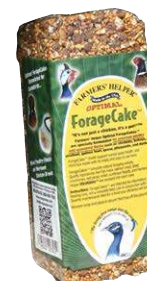
302 • 13 oz. • 8/cs. Farmers' Helper™ Optimal ForageCake™