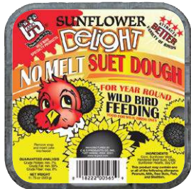
565 • 11 3 / 4 oz. • 12/cs. Sunflower Delight