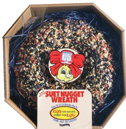
249 • 2.6 lbs. • 4/cs. Suet Nugget™ Wreath 3 1/8" x 10 1/2" x 10 1/2" high