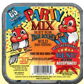
513 • 11 oz. • 12/cs. Party Mix