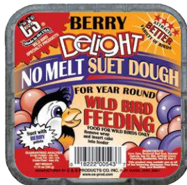
543 • 11 3 / 4 oz. • 12/cs. Berry Delight