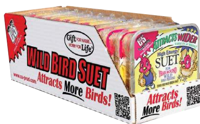
SUET TREAT CASE OF 12