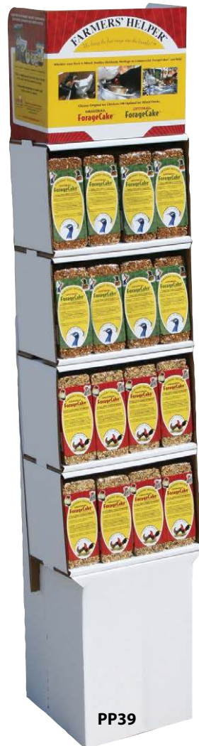
11 3 / 8 " d x 12 1 / 4 " w x 58 1 / 8 " h