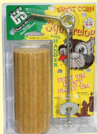
610 • 12/cs. Sweet Corn Squirrelog™ with Hanger