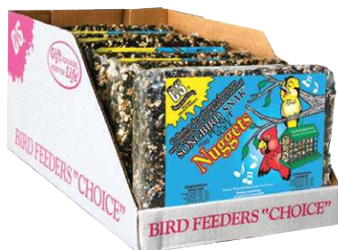
SNAK™ CASE OF 6