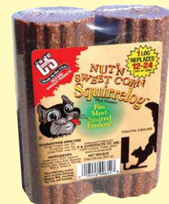
611 • 32 oz. Nut 'N Sweet Corn Squirrelog™ Refill 2/pack • 12/cs.