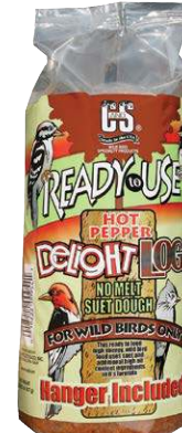
954 • 2 lbs. • 8/cs. Hot Pepper Delight Log