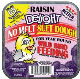
515 • 11 3 / 4 oz. • 12/cs. Raisin Delight