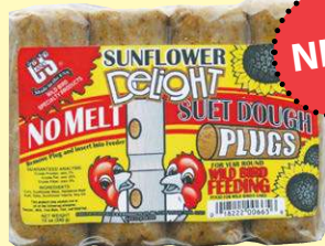
665 • 12 oz. • 4 pack • 12/cs. Sunflower Delight No Melt Plug