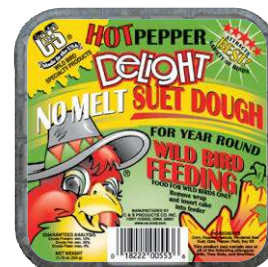
553 • 11 3 / 4 oz. • 12/cs. Hot Pepper Delight