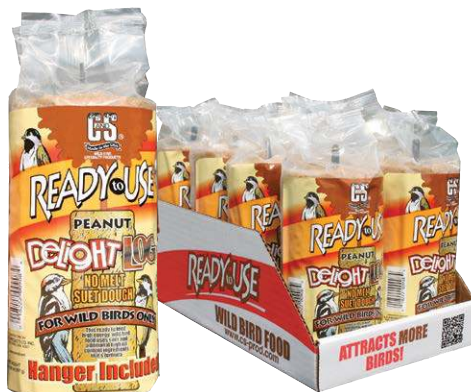
908 • 2 lbs. • 8/cs. Peanut Delight Log