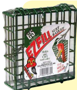
730 • 8/cs. Green EZ Fill Suet Basket 1 3 / 4 " x 4 3 / 4 " x 5 5 / 8 " high Holds 1 Cake