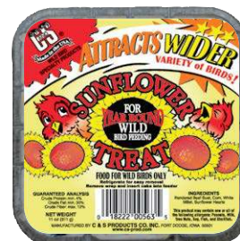
563 • 11 oz. • 12/cs. Sunflower Treat