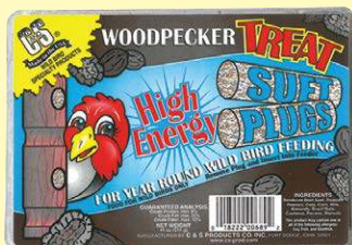
689 • 11 oz. • 4 pack • 12/cs. Woodpecker Treat Suet Plug