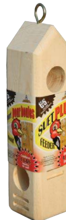
770 • 6/cs. Suet Plug Feeder Holds 4 plugs 3" x 3" x 12 3 / 4 " high

C&S warrants its feeder products to be free from manufacture defects when used according to its directions and intended purpose for a period of 90 days from the date of purchase. Warranty claims are to be made directly by the consumer to C&S's Customer Service Department at 1-800-373-2425.