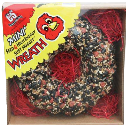
246 • 1.7 lbs. • 6/cs. Mini Suet Nugget™ Wreath 2 3/4" x 8 3/8" x 8 5/8" high