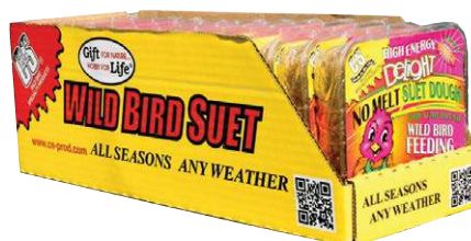
SUET DOUGH CASE OF 12