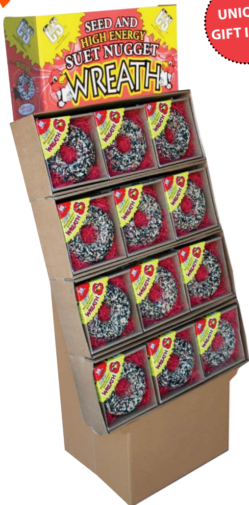
PP18 Mini Suet Nugget™ Wreath Display 17 1/2" d x 25 3/4" w x 64 1/2" h