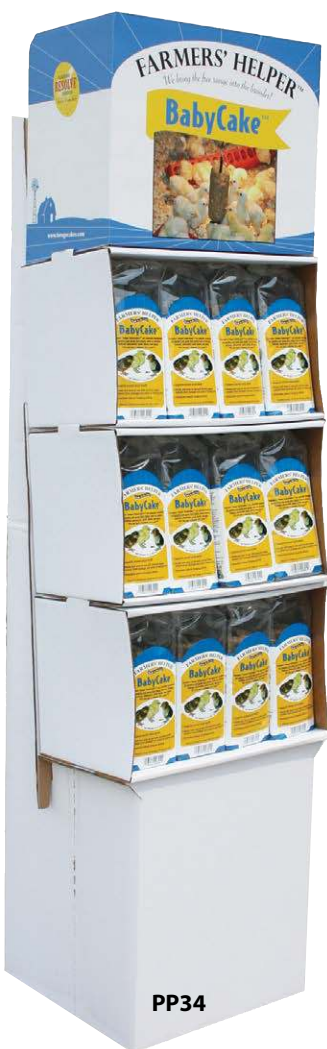
12 3 / 8 " d x 13 3 / 4 " w x 53" h