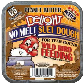
581 • 11 3 / 4 oz. • 12/cs. Peanut Butter Delight