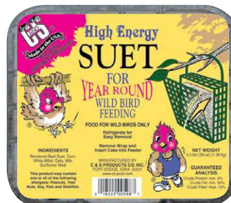
598 • 56 oz. • 6/cs. High Energy Large Cake