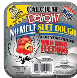
517 • 13 1 / 4 oz. • 12/cs. Calcium Delight