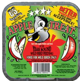
545 • 11 3 / 4 oz. • 12/cs. Apple Treat