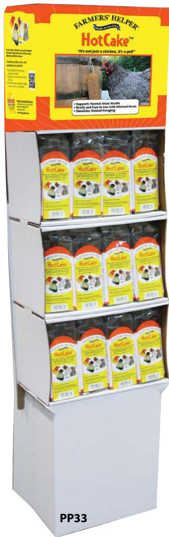
12 3 / 8 " d x 13 3 / 4 " w x 53" h