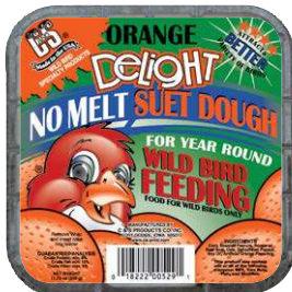
529 • 11 3 / 4 oz. • 12/cs. Orange Delight