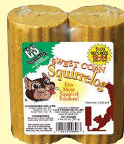
608 • 32 oz. Sweet Corn Squirrelog™ Refill 2/pack • 6 or 12/cs.