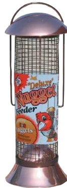
757 • 8/cs. Deluxe Nugget™ Feeder Holds up to 15 oz. 3 7 / 8 " x 3 7 / 8 " x 10 1 / 2 " high