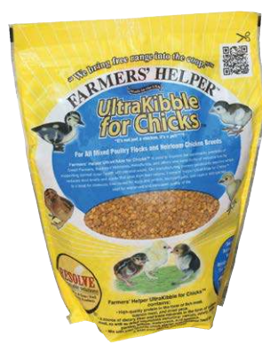
335 • 36 oz. • 6/cs. Farmers' Helper™ UltraKibble for Chicks™