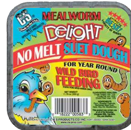
583 • 11 3 / 4 oz. • 12/cs. Mealworm Delight