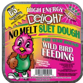
505 • 11 oz. • 12/cs. High Energy Delight