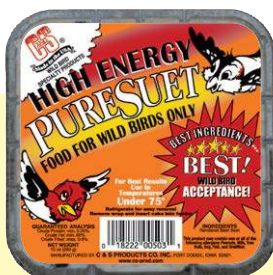
503 • 10 oz. • 12/cs. Pure Suet