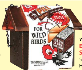
727 • 6/cs. EZ Fill Bottom Suet Feeder 5 1 / 2 " x 6 1 / 2 " x 5 3 / 4 " high Holds 3 Cakes