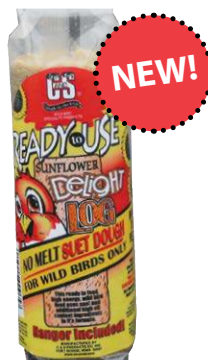
965 • 16 oz. • 8/cs. Sunflower Delight Log