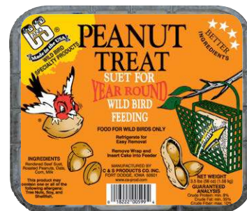
599 • 56 oz. • 6/cs. Peanut Treat Large Cake