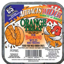
561 • 11 3 / 4 oz. • 12/cs. Orange Treat

BIRDS ENJOY OUR MANY FLAVORS OF SUET YEAR ROUND