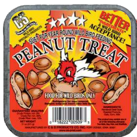
509 • 11 oz. • 12/cs. Peanut Treat

FLAVORED PELLETS MAKE THESE PRODUCTS A FAVORITE FOR ALL BIRDS