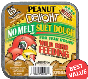
507 • 11 3 / 4 oz. • 12/cs. Peanut Delight