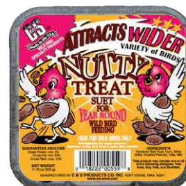
559 • 11 3 / 4 oz. • 12/cs. Nutty Treat