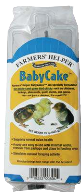
304 • 15 oz. • 8/cs. Farmers' Helper™ BabyCake™