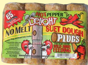
683 • 12 oz. • 4 pack • 12/cs. Hot Pepper Delight No Melt Plug