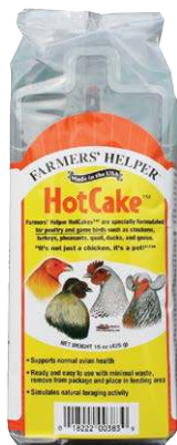
383 • 15 oz. • 8/cs. Farmers' Helper™ HotCake™