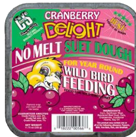
566 • 11 3 / 4 oz. • 12/cs. Cranberry Delight