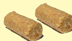
770 • 6/cs. Suet Plug Feeder Holds 4 plugs 3" x 3" x 12 3 / 4 " high