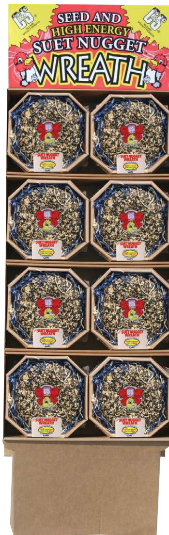
PP17 Suet Nugget™ Wreath Display 17 1/2" d x 21 3/4" w x 70" h