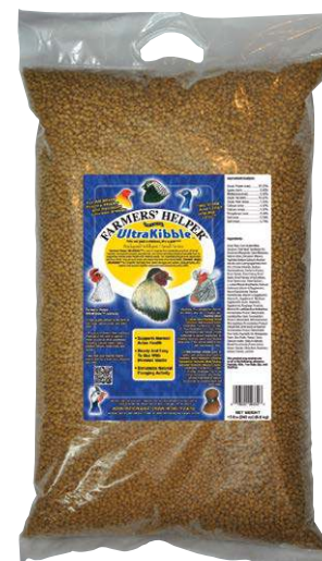
332 • 15 lbs. Farmers' Helper™ UltraKibble™